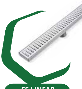
SS LINEAR SHOWER DRAIN