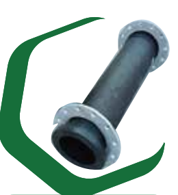
ASTALON ECO BACKING RINGS