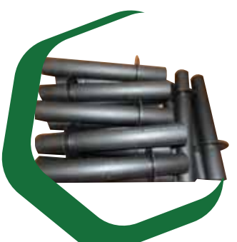
POLY PUDDLE FLANGES